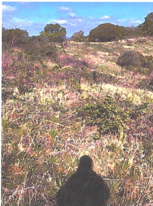
Basin/crest at right side