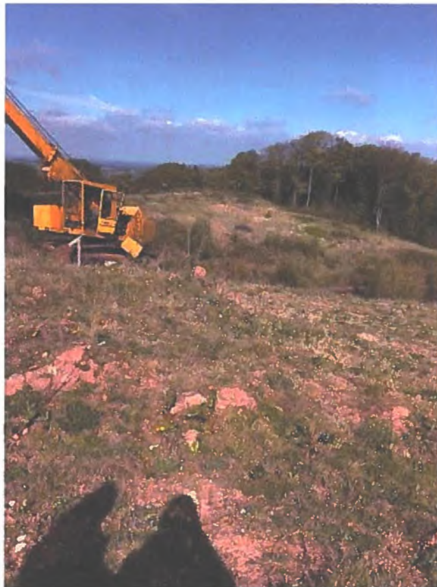
View towards dam