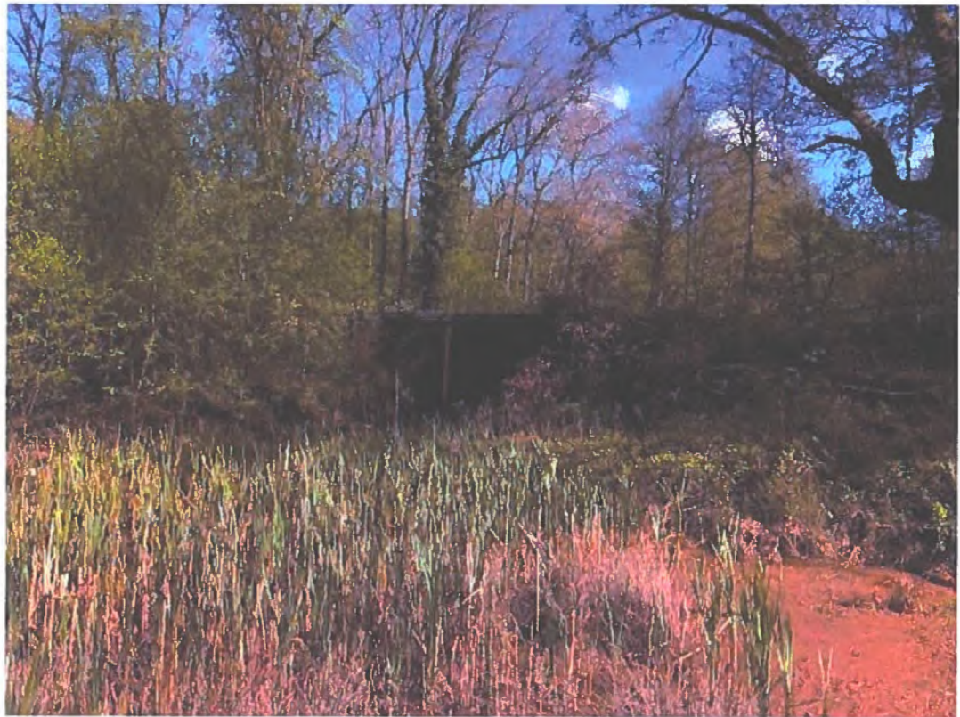
View back to road