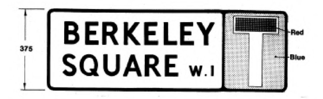
FIG. V PRE-1965 REVISED STANDARD(%)-100 & 50