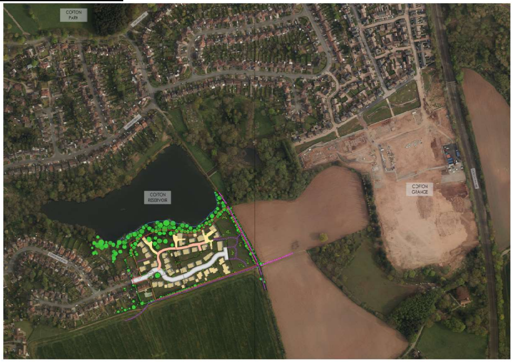
Appendix 1 – Illustrative Masterplan