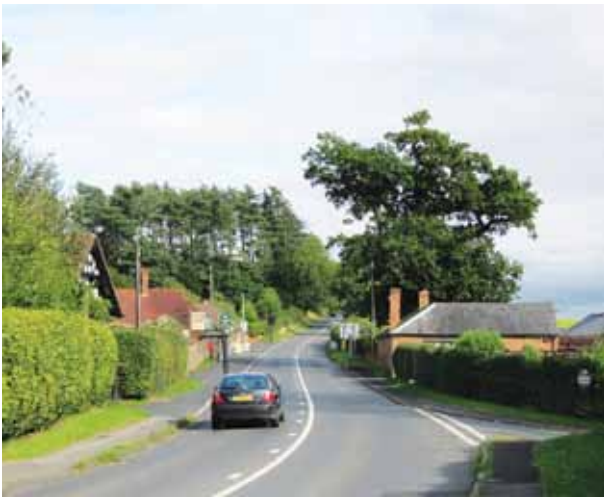
View of Hewell Lane looking Southeast