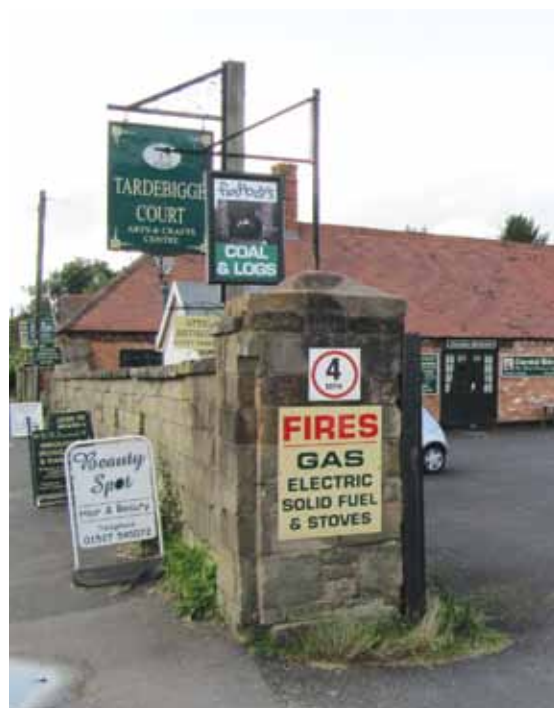
Signage at Tardebigge Court