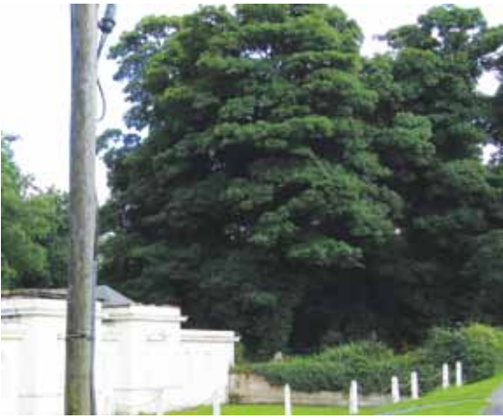
Trees at South Lodge, Hewell Lane

2.7 The Council is empowered under the Town and Country Planning legislation to protect the environment within the district by placing Tree Preservation Orders on trees and groups of trees where it is in the public interest to do so. The Council regularly makes such orders and a group order was placed on the Hewell Estate a few years ago and has recently been revised. It is an offence to carry out any work to protected trees without the formal consent of the Council.