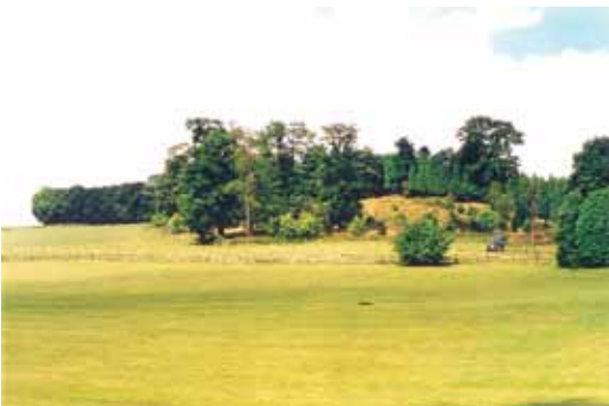
View across Hewell Park