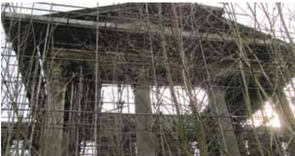
Ruins of The Old Hall, Hewell Park

Hewell Park was included on the National Heritage at Risk register in 2009 (one of only 2 Parks at Risk in Worcestershire) because of ongoing significant condition problems and is categorised in the register as having high vulnerability. The Hereford and Worcester Gardens Trust are seeking to address these problems, commissioning a Landscape Appraisal in 2001 and coordinating the recent restoration of the island to the lake and iron bridge, which was carried out by HMP Hewell staff and prisoners.