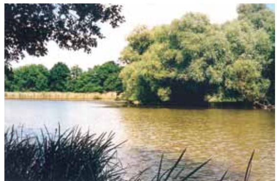
The Lake, Hewell Park