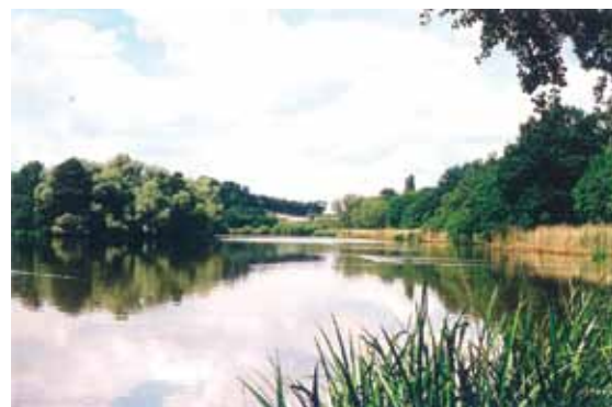
The lake, Hewell Park, ©Parklands Consortium Ltd 2001

2.6 The lake to the north of the Conservation Area is designated as a Site of Special Scientific Interest (SSSI). This designation includes the lake, the eastern and south eastern lakeside woodlands and the mixed ornamental woodlands to the SE of the Grange and SW of the lake. Again this brings no additional planning controls, but consent is needed from Natural England for certain types of works. Part of the SSSI is managed by the Worcestershire Wildlife Trust as a nature reserve because of its importance for breeding and wintering water birds.