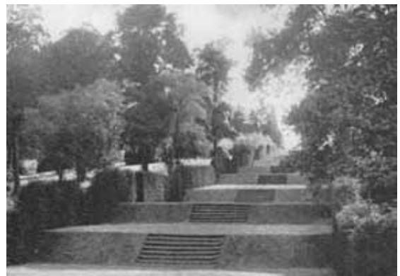
Grass steps to water tower, date unknown.