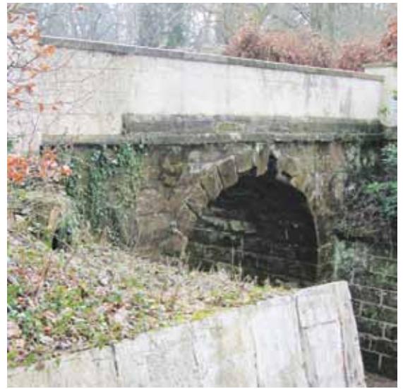
Sandstone bridge, Hewell Park

To the rear of the main house is the Grade II listed Tennis Court (now in use as the prison gym) which was originally built in 1820 with alterations to raise the roof and add dressing rooms carried out in 1891. The prominent Grecian balcony supported by four Coade stone caryatids and stone balustrade is the strongest architectural feature, on what is otherwise a rather restrained design. The porticoed entrance on the south west corner and the vestibule on the southern elevation have unfortunately been demolished. A set of stone steps dating from the 1830s, lead down to the Dutch garden from the tennis court to the south. The sandstone bridge to the South of the Tennis Court dates from the 1820s and although the original balustrade has been lost, this structure still has historic merit and is protected as curtilage listed. Beyond this a large Coade stone urn on a grey sandstone pedestal survives. Adjacent to the tennis court are the former stables, now used as offices by the Prison Service Works Department. The building is curtilage listed and reputedly dates from the 1680s but has been extensively altered.