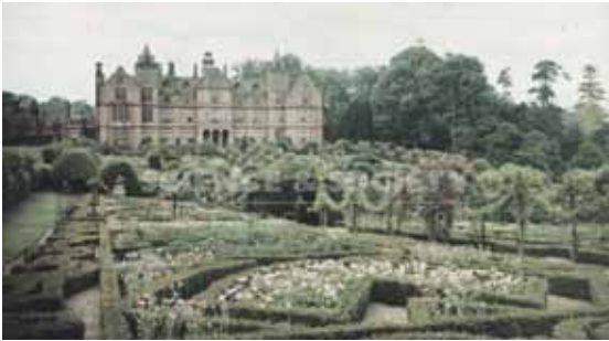
Hewell Grange garden front c.1910, Arthur E Morton

The gardens and park at Hewell Grange are in fact the most recent manifestation of a history of landscaping undertaken at the behest of the Earls of Plymouth. Among the most outstanding elements of the history still visible on the site are the improvements to the lake undertaken at the advice of William Shenstone; the lakes later remodelling with extensive tree planting undertaken by Lancelot Brown in the second half of the 18th century and the continuing enhancement of the pleasure grounds and park in the early 19th century by Humphrey Repton. The improvements also embrace the architectural improvements undertaken after 1815 by Thomas Cundy (Snr), firstly to the house and possibly including the creation of the Real Tennis Court. Further ornamentation to the pleasure grounds and the creation of extensive formal gardens were completed during the 19th century, culminating in improvements undertaken at the end of the century and beginning of the 20th century in conjunction with the design for the new house by Bodley and Garner, constructed between 1884 and 1891. Much of the historic design in terms of circulation patterns, structures, details of surface finish, planting and water features, has been eroded, replaced, or is in poor condition