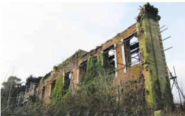
Ruins of The Old Hall, Hewell Park

The ruins of the Old Hall (Grade II listed) which was substantially demolished in 1899, survives to the east of the present house and is included on the Councils Buildings at Risk register because of its deteriorating poor condition. The building was a 1712 reworking of an earlier 16th century manor house with later 19th century additions, but only the front elevation and part of the side and rear walls survive. The front pedimented portico depicting the Plymouth coat of arms with Corinthian columns demonstrates the grandeur of this once fine building, now in perilous condition and permanently scaffolded.