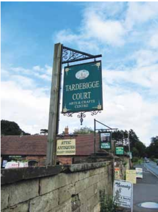
Tardebigge Court, Hewell Lane

The Hewell Grange Conservation Area includes the area currently designated as a Registered Historic Park, the immediate surroundings of the former Paper Mill and Kennels to the Southeast of the prison, and the properties within Tardebigge village. This boundary was suggested and supported by the Victorian Society and the Hereford and Worcester Gardens Trust, to encompass what remains of the historic Hewell Grange estate. A map of the Conservation Area boundary is attached as Map 1, a map of the existing registered historic park boundary is attached as Map 2.