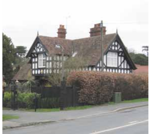
Dairy Cottage, Hewell Lane