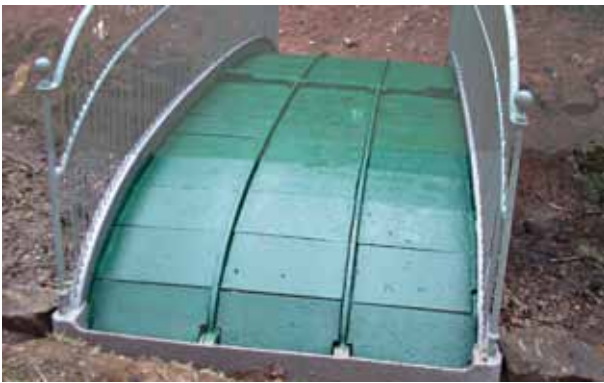
Iron bridge, Hewell Park 2009.