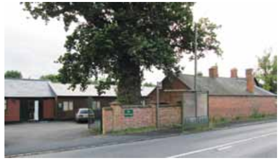
The Forge, Hewell Lane

On the opposite side of Hewell Lane facing the entrance to Hewell Close are a pair of late 19th century lodge buildings, both unlisted. Southwest Lodge on the left was once the Works Foreman's Cottage and is by Goddard and Paget, who were prominent Victorian architects. Built in 1880, the decorative tile hanging with half timbered gables and carved brackets is typical of the period and the architects. On the right and mostly concealed from view is Hewell Dairy Cottage which was built in 1885 and has a slightly heavier style than Southwest Lodge. The single storey dairy building to the rear survives.