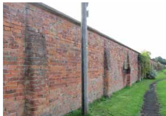
Walled kitchen garden, Holyoakes Lane

2.5 A large proportion of the proposed Conservation Area is within a Grade II* registered historic park. Although this designation brings no additional planning controls, the special interest of the park is a material consideration when the Council assesses any applications for planning permission. The Garden History Society must also be consulted on any planning applications which could affect its special interest.