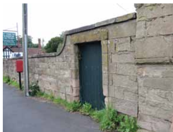
Wall to Tardebigge Court