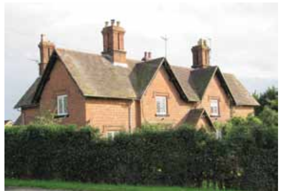
Rose Cottages, Hewell Close