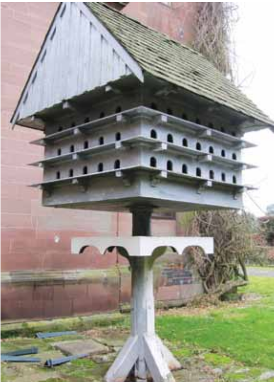
Dovecote to rear of Hewell Grange

3.2 The Hewell Grange Conservation Area is significant because of the high number of listed and unlisted historic buildings, and the connection between the wider landscape and the built environment. As a historic entity the inter-relationship between the setting of the listed buildings and the registered historic park is a key element of the special interest of this Conservation Area. Some fragmentation has occurred as the original estate has been sold in parcels to individual owners; however this has been largely mitigated by the passing of the bulk of the park into Crown ownership.