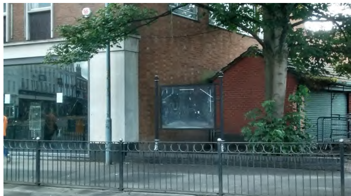
The noticeboard located by the old Market Hall site.

The Task Group received information on a wide range of activities provided by Leisure Services, which not only included organised or sports based activities but also details of the parks and open spaces available throughout the District, which were available for residents to enjoy all year round, together with details of the allotments which were available to rent. Members were pleased to note that for some allotment sites there was the option to rent a smaller plot in order for residents to get a taster before progressing to a full sized plot. The Task Group was also provided with information on BRAVO (Bromsgrove and Redditch Active Volunteering Opportunities) which had a wealth of sports clubs and organisations which played a key role in providing leisure activities for the people of both Redditch and Bromsgrove. This was a flexible programme and there was a wide variety of placements for volunteers to choose from ranging from IT support fro clubs to assistant coaches and health intervention for older people.