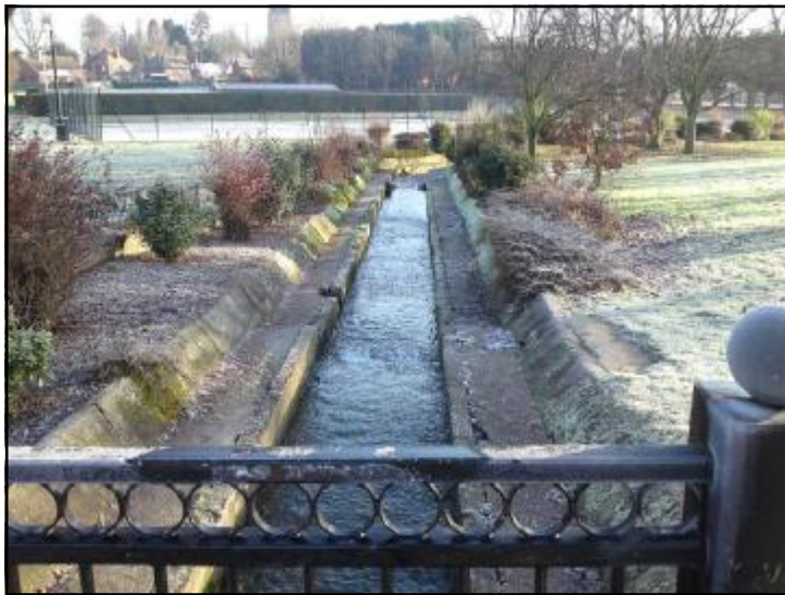
TYPICAL EXISTING CONDITIONS OF BATTLEFIELD BROOK

CONCEPT: RE-NATURALISATION OF A TRIAL SECTION OF THE HEAVILY CANALISED REACH OF BATTLEFIELD BROOK THROUGH SANDERS PARK, BROMSGROVE.