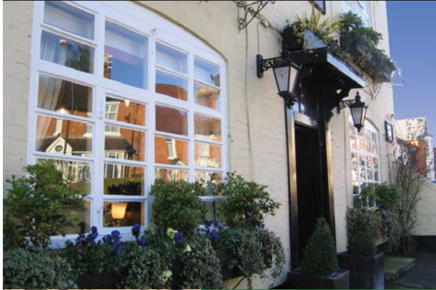
'The Bell & Cross Public House' Bromsgrove Road