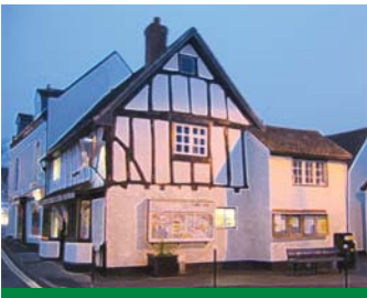
'Red Lion Street and Bear Hill'

The combination of timber framed buildings alongside Georgian brick buildings in the historic village centre, gives Alvechurch its particular style and apparent small size. This has been retained latterly as modern housing developments are not obviously visible from this area. Recognition of this special character led to the designation of the Alvechurch Conservation Area in 1968, one of the first two to be designated in the Bromsgrove District.