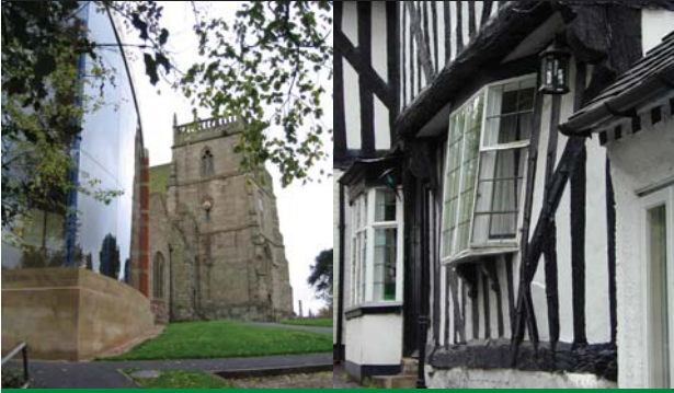
'Parish Church of St. Laurence' and 'The Old House', Bear Hill

Alvechurch is notable for being a planned medieval market settlement which has retained much of its form. The village is rural in character although it lies barely two and a half miles from the edge of the West Midlands Conurbation in the north and about the same distance from Redditch in the south. It is thought to have originated in 8th Century when it was called Aelfgithcirce and based around a medieval church which existed on the site of the Church of St. Laurence. Through the years the name was modified in various stages to be Alvechurchie in the time of the Domesday survey, to the present day Alvechurch.